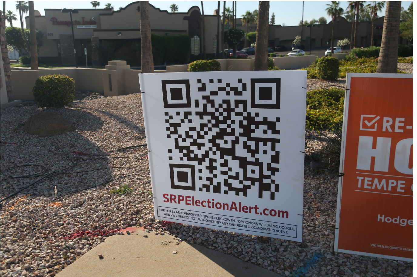
Exhibit D - Exhibit-D_sign-photo-01.jpg