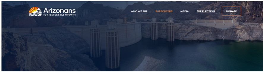
Exhibit C - Exhibit-C_azfrg-supporters-page.png